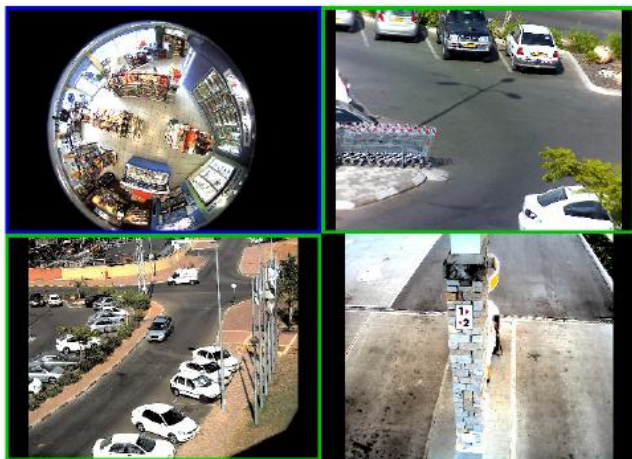
Full Screen Option